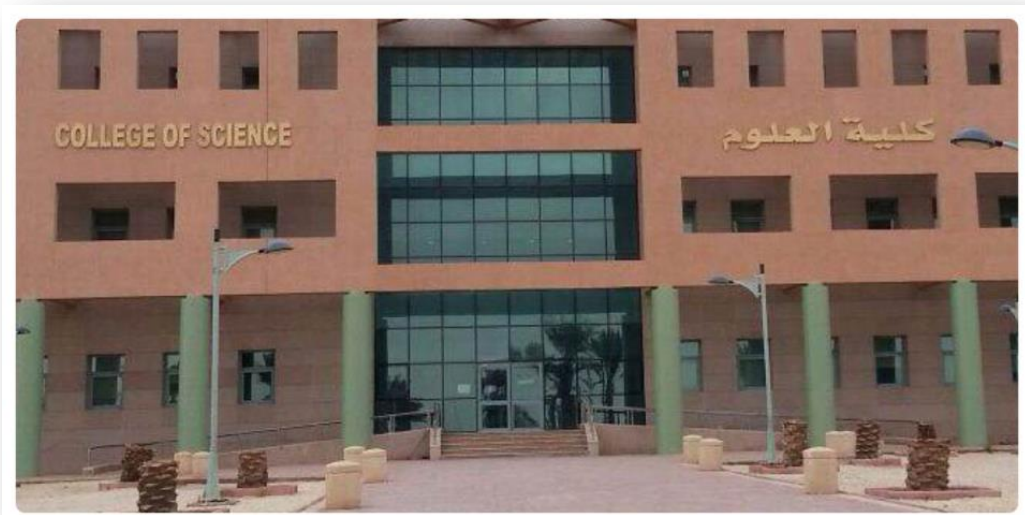
College of Science at Al-Zulfi -Majmaah University

Main Campus at Al- Zulfi P.O. Box 1712, Zulfi ,11932 Kingdom of Saudi Arabia