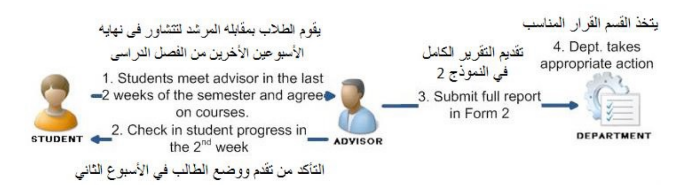
Figure 2: Progress Reporting Process